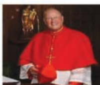
Cardinal Timothy Dolan Archbishop of New York, Author

VISIT MANUPPHILLY.COM FOR MORE INFORMATION AND TO REGISTER