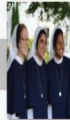
Sisters of Life What It Means to Be a Sister