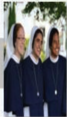
Sisters of Life What It Means to Be a Sister