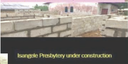
Isangele Presbytery under construction