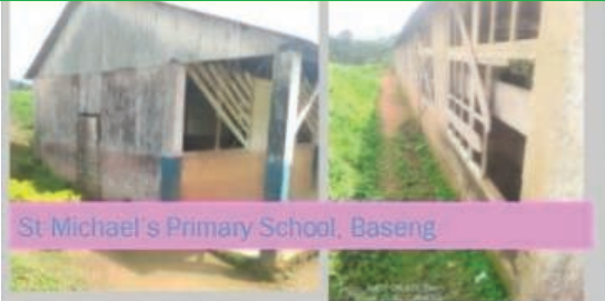
St Michael's Primary School, Baseng

There are poor living conditions and great need for renovation of churches and rectories as well.