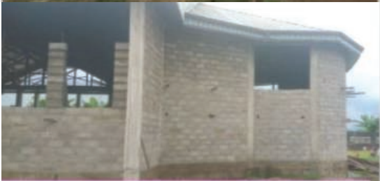
St James Parish Church Ebonji under construction