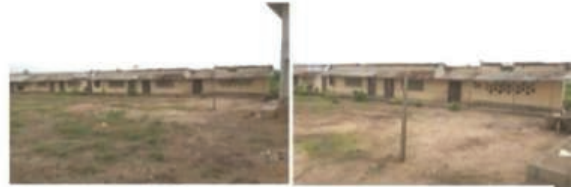
ST THOMAS NURSERY AND PRIMARY SCHOOL, NTAM