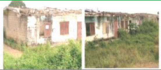
ST AGNES NURSERY AND PRIMARY SCHOOL KOSALA

Below are some of the schools earmarked to be renovated last year but have not yet been renovated due to lack of financial means.