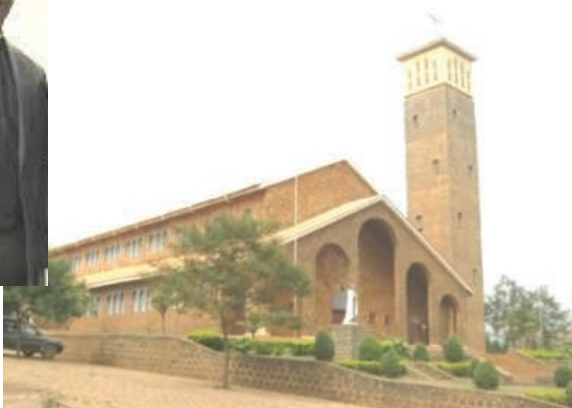
Sacred Heart Cathedral of the Diocese of Kumba, Cameroon

Below are some of the schools earmarked to be renovated last year but have not yet been renovated due to lack of financial means.