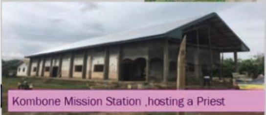
Kombone Mission Station, hosting a Priest