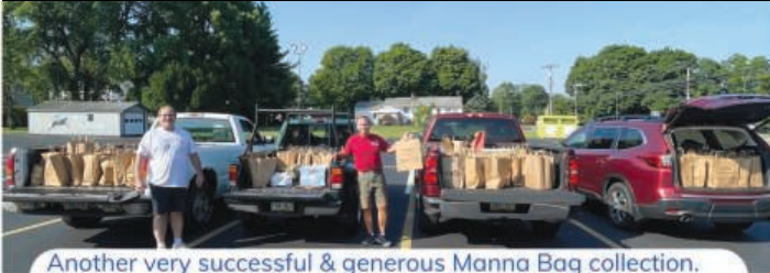
Another very successful & generous Manna Bag collection. Thanks to all who performed these Corporal Works of Mercy.

We missed the girls and boys who could not join us. Thank you all for your dedication and service at the altar.