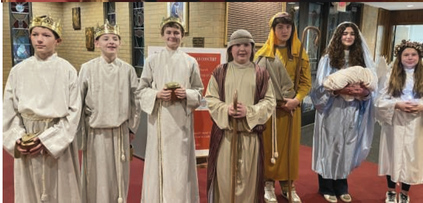
Students from the our Religious Education Program performed their very special rendition of the Nativity in anticipation of our Savior's Birth.