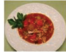
MARYLAND CRAB SOUP

ALL ORDERS MUST BE SUBMITTED AND PAID BY SUNDAY MARCH 10 TH