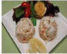
SMITH ISLAND FRESH CRAB CAKES

It's Back ! Capt'n Chucky's Seafood Sale!