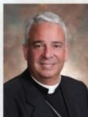
Archbishop Nelson J. Pérez Celebrant